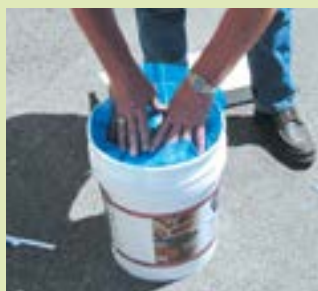
Replace plastic liner over the surface of the sealant