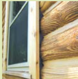
Insert Log Gap Cap™ into void between logs and frame. Leave 3/8" gap between surface of foam and edge of frame