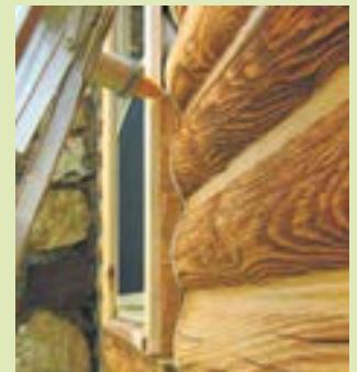
Fill the 3/8" gap between the surface of the foam and the edge of the frame with sealant