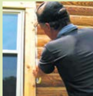
Apply masking tape to prevent sealant from smearing onto the adjacent logs