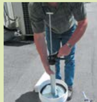
Ensure the tight seal, fully extend rod and fill the barrel. Disengage from the follow plate