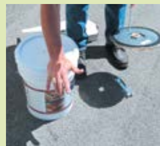
Replace the lid. Make sure that it is tight on the pail