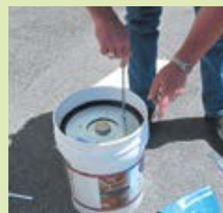
Insert the handle rod into the open nut to remove the follow plate