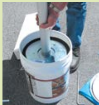
Remove the cap and cone tip from the gun barrel and push the end of the barrel onto the hole