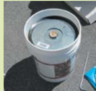
Place the follow plate on top of the chinking pail