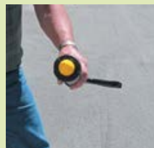
Attach the end cap and cone tip to the end of the barrel