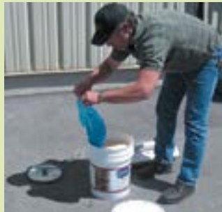
Remove the lid and the plastic liner from the pail