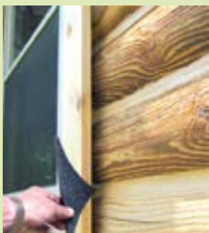
Use Log Gap Cap™ where round logs meet window and door jamb trim